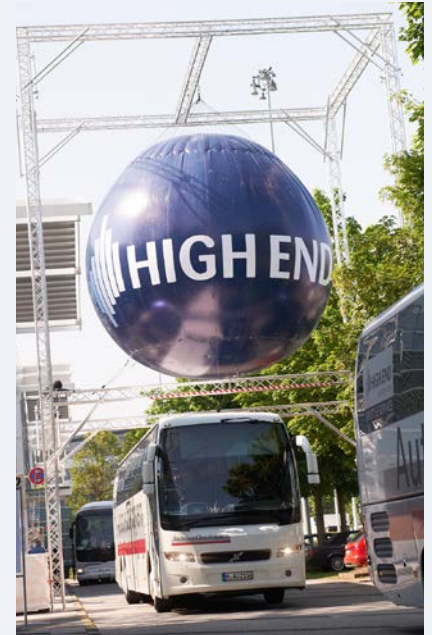
Welcome to the HIGH END 2016

As always, in choosing the exhibitors it has to be ensured that their products and services suit the remit of the fair, and thus the focus is on increasing quality, which is far more important to the HIGH END SOCIETY than selling more and more spaces to as many exhibitors as possible.