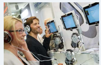
Headphones provides enjoyable music experiences