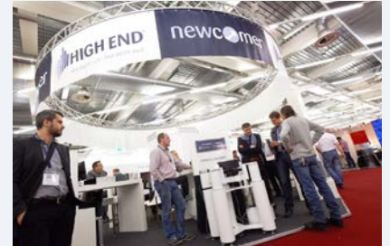
Start-up companies > picture download on the HIGH END

From start-ups to small and medium-sized enterprises or multinationals, the HIGH END is a platform for the industry to present the technology which will be with us in the future.