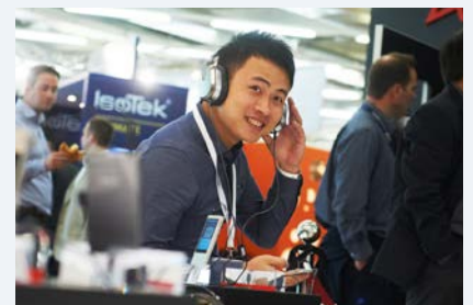
Latest headphones > picture download technologies