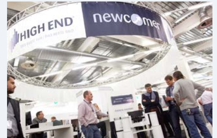
Modern music systems > picture download